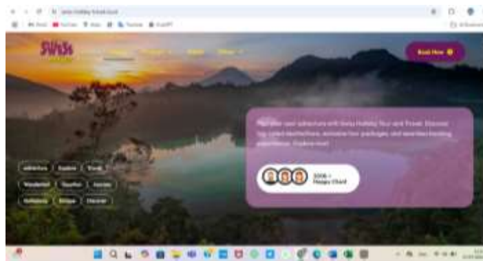
Figure 2. Website Design Result

the technical steps involved in developing the website for Swiss Holiday Tour and Travel Malang. The process begins with purchasing a domain and hosting through an online provider, followed by logging into the hosting dashboard. After that, WordPress is installed as the main platform for website development.